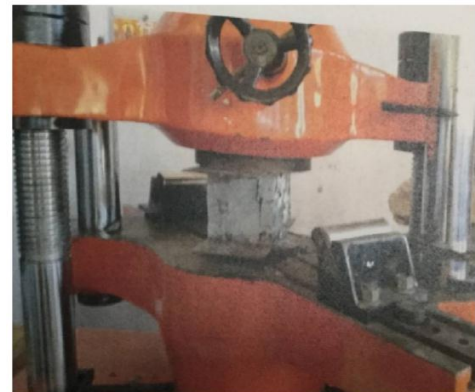
Fig- Compressive strength test apparatus