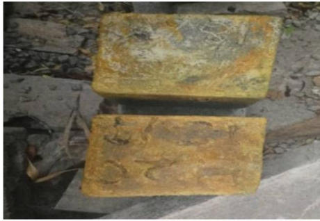
Fig- Acid reaction on cube's surface.