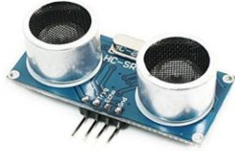
Fig. 2 : Ultrasonic Sensor

output of these sensor is connected by a buzzer. Arduino can be coded according to the requirements.