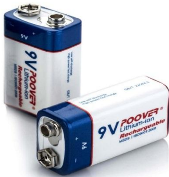
Fig.3 : Battery

A Battery is used for providing the electrical power to the smart guide stick. 9volt battery is used in the smart guide stick to provide processing of the equipment attached over the smart guide stick.