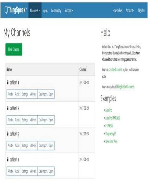
Fig-5: Thingspeak cloud with patient channels

Indeed, even this information is put away for a lifetime and can be gotten to whenever consequently can be utilized for future references.