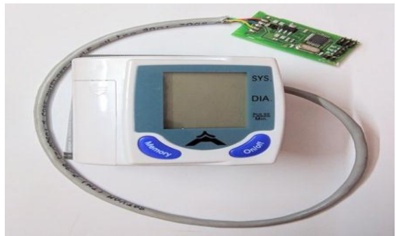
Fig-3: Sunrome BP and Pulse Rate Sensor