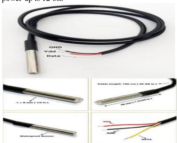
Fig-2:DS18B20 Temperature Sensor

The DS18B20 is the one of the best reasonable sensor for measuring the human body temperature (exact to \pm 0.5 °Centigrate over the extent of -55°C to +125°C) .We can put these sensors at different spots of the human body like on forehead, under arms and even under the tongue on account of its waterproof. The DS18B20 has three wires i.e. VCC, GND, DATA are mounted in a solitary wire. The DS18B20 uses Maxims exclusive 1-Wire bus protocol implements bus communication using one control signal. The control line requires a weak pullup resistor since all devices are linked to the bus via a 3-state or open-drain port (the DQ pin in the case of the DS18B20). In this bus system, the microprocessor (the master device) identifies and addresses devices on the bus using each devices unique 64-bit code. Because each device has a unique code, the number of devices that can be addressed on one bus is virtually unlimited. The 1-Wire bus protocol, including detailed explanations of the commands and time slots, is covered in the 1-Wire Bus System section. Another feature of the DS18B20 is the ability to operate without an external power supply. The core functionality of the DS18B20 is its direct-to digital temperature sensor. The resolution of the temperature sensor is user-configurable to 9, 10, 11, or 12 bits, corresponding to increments of 0.5C, 0.25C, 0.125C, and 0.0625C, respectively. The default resolution at power-up is 12-bit.