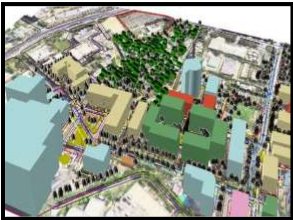
Fig 2- GIS based 3D Modelling for MIDCs Millennium Business Park, Mahape.

In city planning managing, the third dimension is becoming a necessity. 3D GIS modeling offers a flexible interactive system while providing one of the best visual interpretation of data which supports planning and decision processes for city planners. As a result, 3D GIS model expresses terrain features in an intuitive way which enhances the management and analysis of a proposed project through 3D visualization.