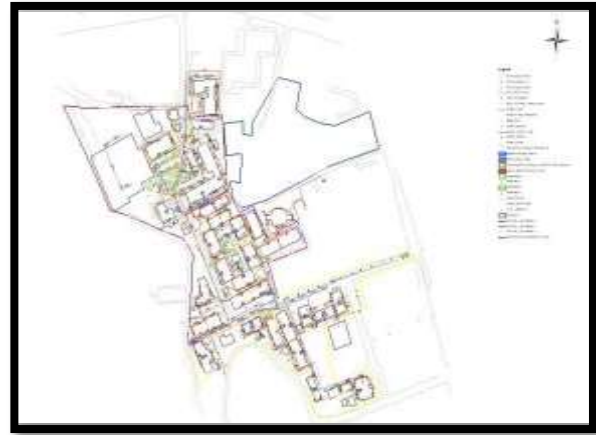
Fig 3- GIS based integrated mapping OF MIDCs Millennium Business Park, Mahape.

on and off, it can be used either to focus on specific data elements or to view new combinations of elements