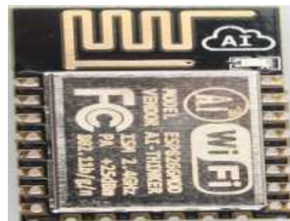
Figure 2. Wi-Fi module

ESP-12E is a low power consumption of the UART-Wi-Fi module, with very competitive prices in the industry and ultra-low power consumption technology, designed specifically for mobile devices and IOT applications, user's physical device can be connected to a Wi-Fi wireless network, Internet or intranet communication and networking capabilities.