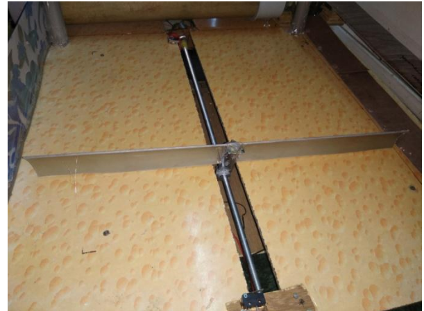
Fig. 4. Washing Assembly

The screw rod having a wiper is fitted over it. The screw rod is connected to the 12V DC Motor. There is limit switch is used at the both ends in this assembly to control the movement of the cleaning wiper. There is a relay switching circuit in the circuitry to change the direction of the motor.