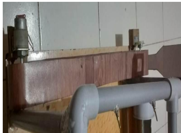
Fig. 1. Feeding Conveyor assembly

In feeding system is consisting of a conveyor belt which is driven by the DC Motor. Motors are supplied through the relay module and the relay is driven by the PLC. There is timer is set in the PLC which defines the frequency of the timing of the conveyor belt. As the conveyor will rotate enough then it will automatically stopped. The timing of the rotation of conveyor is predefined. The timing is changed according to the length of the conveyor.