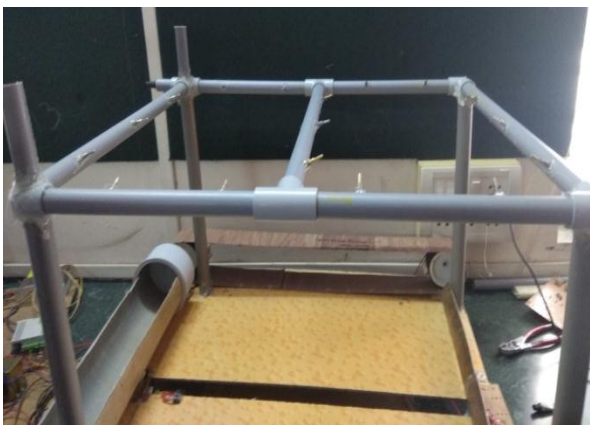
Fig. 3. Fire Safety Assembly

It is one of the most important assembly in this project that is fire safety assembly, which consist of pipe network having a pipe frame interconnected. The water pump of 230V AC is connected at the one end of the whole frame and the pipe consists of the small sprinklers to spray the water over the surface of the cowshed. This assembly is having a flame sensor which used to detect the fire and it is connected to the PLC for the detection. And water pump is connected to the PLC through relay module.