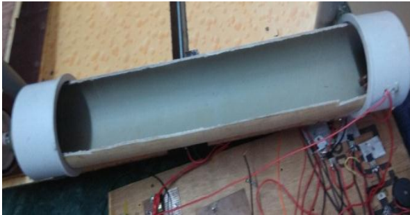
Fig. 2. Water feeding assembly

Water pump is turned on with the relay module which is controlled by the PLC. Here the PLC monitors the water level in the trough.