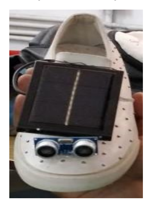
Fig.: Original System