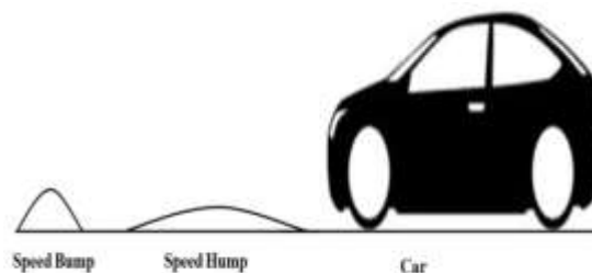
Figure 3.1 Speed Bump and Speed Hump