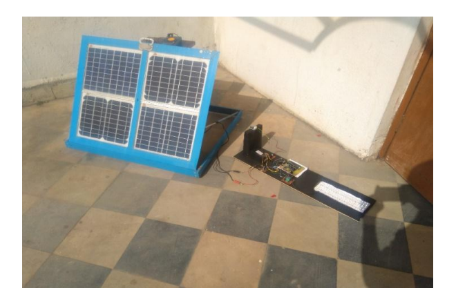
Fig 2. Picture representation

The ground of whole assembly is a common ground.The LED strip which is connected as a load will glow and give a output of 12 or approximate of 12 V.