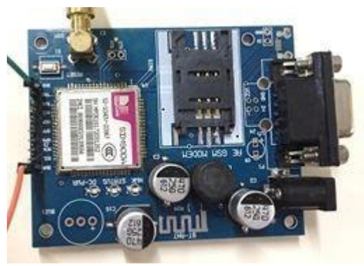
Fig 5- GSM Module

A GSM modem consists of GSM Module along with some other components such as a communication interface (like Serial Communication: RS-232), power supply and some types of indicators. We can connect the GSM Module with an external computer or a microcontroller with the help of this communication interface. The GSM module used here is SIM900.