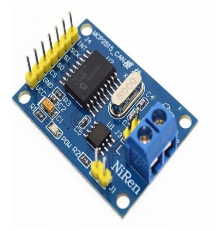
Fig.4. CAN BUS Module MCP2515