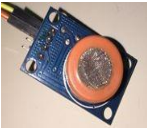
Fig.4. MQ-3 Alcohol sensor

The alcohol sensor used here is MQ-3 which helps to detect whether the driver has consumed alcohol. Whenever alcohol is present in air, the sensor conductivity increases and generated the required output. The sensor is highly sensitive towards alcohol, while that towards benzene, gasoline, smoke and vapour is less. The range of this sensor is up to 2 meters and it can be used for detecting alcohol with varying concentration levels. The MQ3 alcohol sensor operates on 5V DC and consumes approximately 800mW. It can detect alcohol concentrations ranging from 25 to 500 ppm.