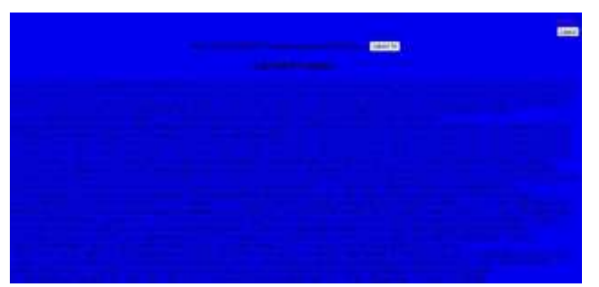
Fig 3: Decrypted Page

Fig3: In the above figure user will download the uploaded file on the server with the help of a secret key which he will get from the admin by sending him a request for a secret key. Users will be able to view the file because it is downloaded in Decrypted.