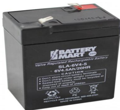
Fig. 1. Battery

Battery is used send current to the refrigerator it is of 6 volts and 7.5 amperes and is of rechargeable type.