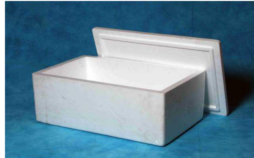
Fig. 2. Thermal Casing

Thermal casing is made of thermo coal and is used for keeping cool inside and to store the storage beverages and food stuffing's in the refrigerator.