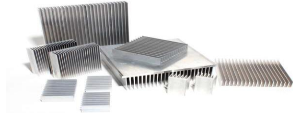
Fig. 3. Heat Sink

A heat sink is a passive heat exchanger that transfers.The heat generated by an electronic or a mechanical device into a coolant fluid in motion. Then-transferred heat leaves the device with the fluid in motion therefore allowing the regulation of the device temperature at physically feasible levels.