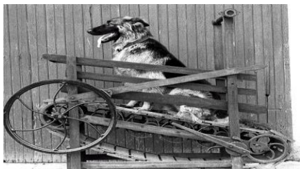
Dog Power Treadmill