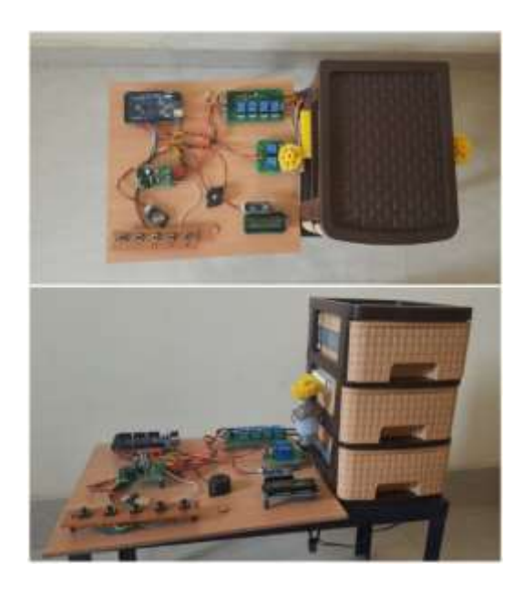
Fig. 2. Hardware implementation of the medicine dispenser

The medicine dispenser is programmed as per the prescription and the tray containing pills is opened accordingly. If the user is not responding even if the tray remains open for more than 5 minutes the alarm is raised. The GSM module is attached to the medical dispenser to send an alert message to the caretaker under circumstances when the user did not consume the medicine and the quantity of the medicines in the tray is low.