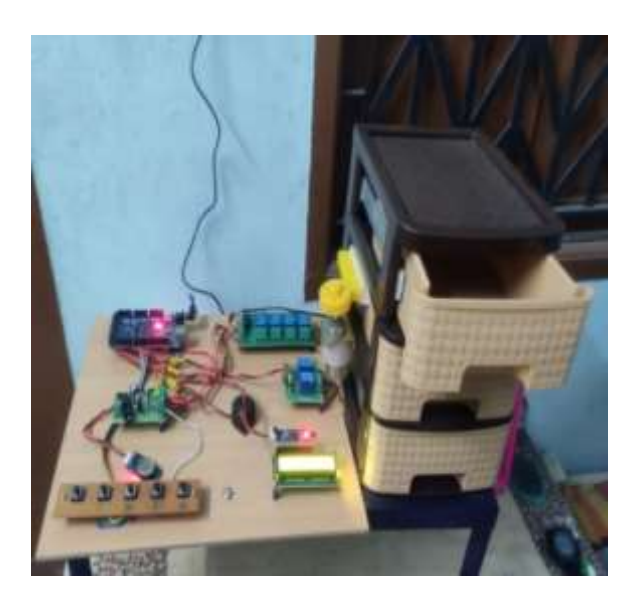
Fig.4. Dispensing of medicine for the morning

The Fig.3 show the display of the time set for opening the tray. The Arduino is interfaced with the DC motor is used to open the tray according to the instruction received.