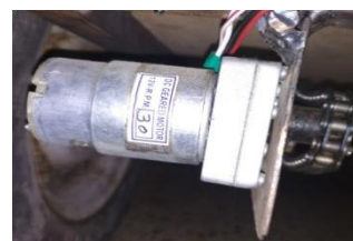
Figure: 2.5 DC MOTOR