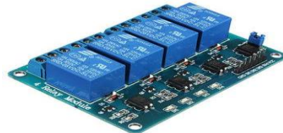
Figure: 2.8 RELAY SWITCH

A relay is an electrically operated switch. Many relays use an electromagnet to mechanically operate a switch, but other operating principles are also used, such as solid state relays. Relays are used where it is necessary to control a circuit by a separate low power signal, or where several circuits must be controlled by one signal.