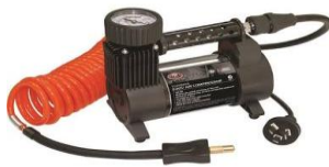
Figure: 2.6 COMPRESSOR