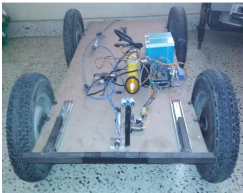
Figure:4.1 WORKING MODEL