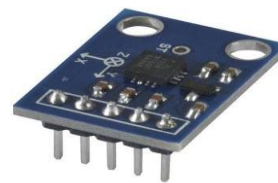
Figure: 2.4 ACCELEROMETER