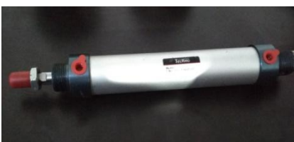
Figure: 2.3 PNEUMATIC PISTON