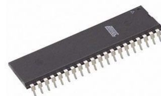
Figure: 2.2 ATMEGA 16

All output signals generated from flex sensors are in analogue form and these signals need to be digitized before they can be transmitted to encoder. Therefore microcontroller ATMEGA 16 is used as the main controller in this project. It has inbuilt ADC module, which digitizes all analogue signals from the sensors and inbuilt multiplexer for sensor signal selection. It supports both serial and parallel communication facilities.