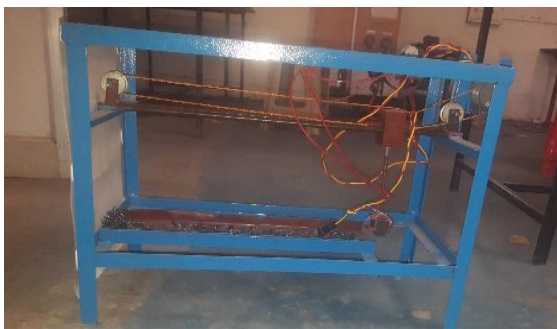
Fig Experimental Setup