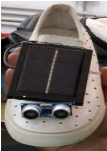
Fig.: Original System