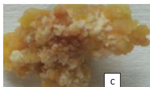
Fig. 1- Callus initiation from leaf (A-C)