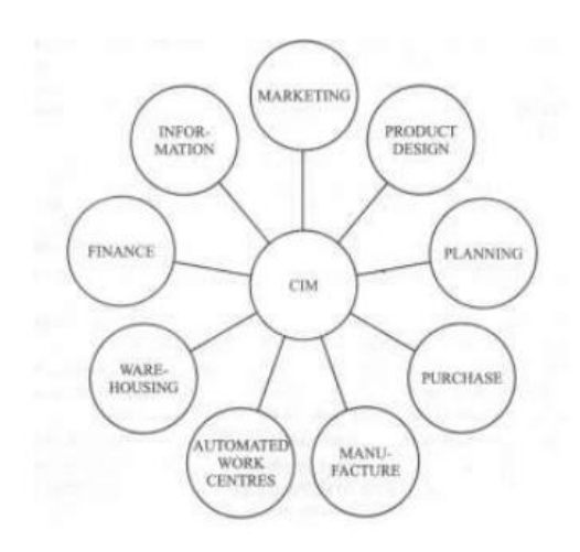
Figure 2 Elements of CIM system