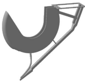
Fig. 2 3-D Model of Furrow

Furrow has two main functions, one is to dig hole and another is to put seed in soil. Furrow is designed in such a way that it will dig a hole about 1.5 inches. It has pipe connected on it through which seed will be dropped from seed collector mechanism. This seed will be directly dropped in hole dig by furrow.