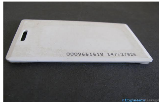
fig. RFID tag