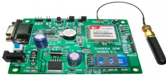
Fig. GSM Module