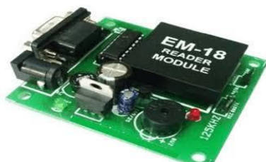
fig. RFID card reader

OTP(One Time Password) An OTP i.e. One Time Password) is more secure than a static password, especially a user-created password, which is typically weak. OTPs may replace authentication login information or may be used in addition to it, to add another layer of security.