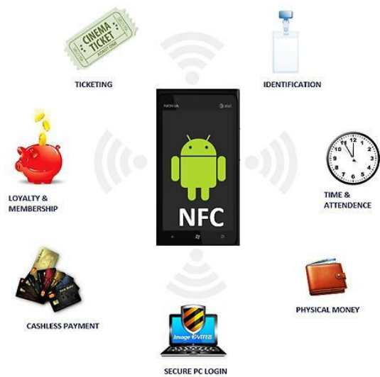
Fig2 : NFC Based Functionality.

The current work used Nearest Field Communications to get mobile nodes and creates Energy efficient architecture for tourist app. At initial stage when NFC nodes enter into sensor range, the NFC send signal and wait for response. As response arrived from receiverNFC tag, then algorithm measure NFC data and convert them into readable Format. From available data,. The proposed system can proceed through following steps :