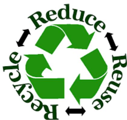
Fig 3 Sustainable Green Concrete Process

The 3R concept which is reduce, reuse and recycle particularly in relation to production and consumption, is very well known today as we are concerned about protecting environment. It is like using recyclable materials more than actual in practice, hence reusing of raw materials if possible after proper treatment to waste materials so that it becomes suitable for use to human beings and hence reducing the use of energy and natural resources. This concept can be applied to the entire life cycles of products and services – starting from design and raw material extraction to lifting, transporting, manufacturing, using, dismantling and finally disposal, hence it can be expressed as under: