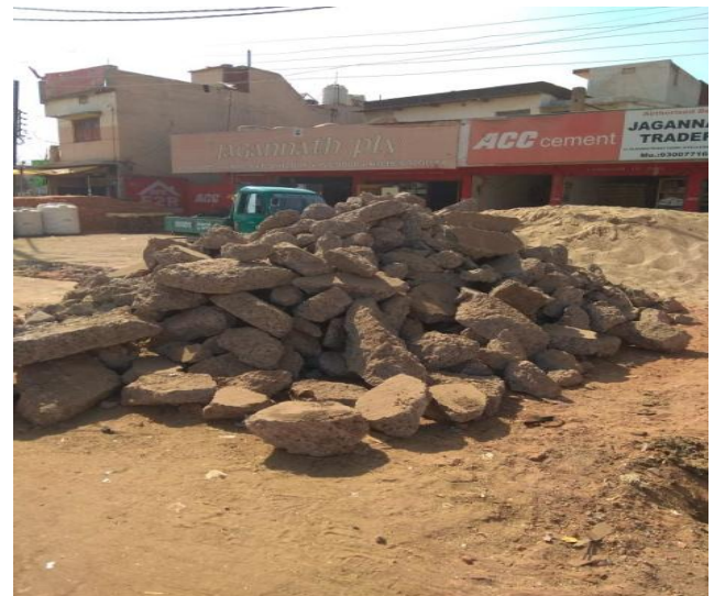
Fig-1 Concrete Waste Generated After Demolished Structure

Increase in the economic growth after development and redevelopment projects in India and increase in the urban population in cities has made construction industry to increase at faster rate, but also impact on environment