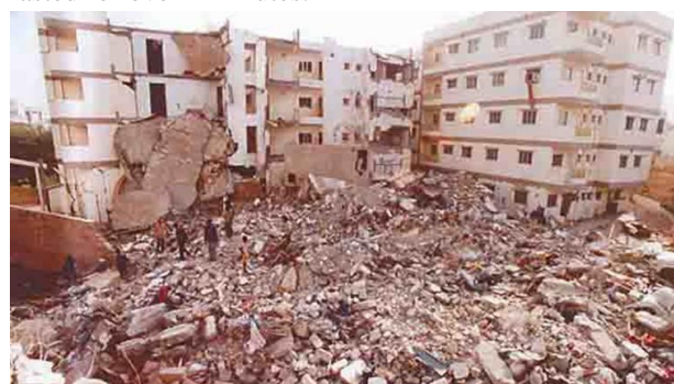
Fig-1 Taluka of Kutch District of Gujarat, India

M aterials used in engineering construction must use satisfy specified quality and strength. Whenever there is disaster like an earthquake, it is important that any building or a bridge or any structure should show its ability as was anticipated in design process. Here plays, a definite role played by material quality used during construction. Earthquake is not only the leading factor to be considered in an engineered design process. A designer initially considers the general stability of the whole structure. Let us take the example of the big disaster that happened in 2001 in Gujarat earthquake, also known as the Bhuj earthquake, occurred on 26 January, India's 51st Republic Day, at 08:46 am IST and lasted for over 2 minutes.