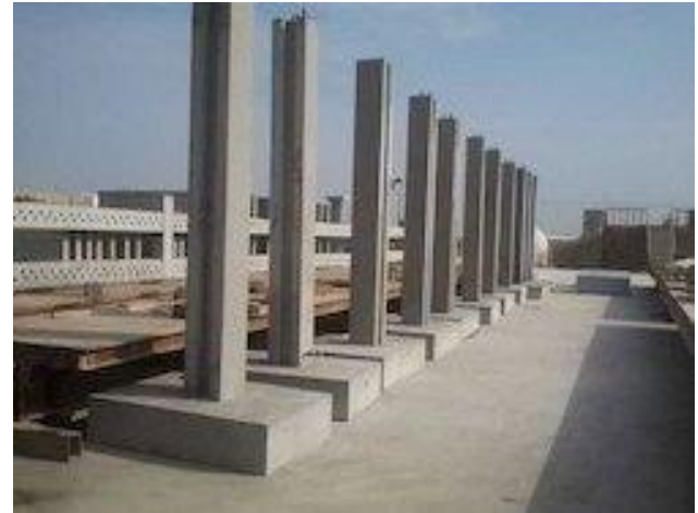
Fig-3 Superior Quality Concrete Columns

Most of the companies maintain international standards for example, BIS ( Bureau of Indian Standards ) is the regulatory body in India to specify and enforce the quality to be maintained in any type of construction. But proper use of a material through a good construction practice is very important. Good quality cement doesn't mean it will form good concrete. For getting good quality concrete you will need good stone, good sand, good workmanship, proper water cement ratio and expert supervision.