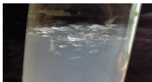
Fig 1- Cadmium Malonate crystals in silica gel

To obtain the cadmium malonate crystal, solution of sodium metasilicate having a density 1.04 g/cc has been prepared. Malonic acid solution of 1M was added to this, until the mixture attains a pH value 5. This mixture i.e. gel is allowed for setting in test tube (15 mm in diameter, 150 mm in length) for 36 hours. After gel ageing time up to 72 hours 0.5 M Cadmium Chloride solution was incorporated as upper reactant over set gel. It was observed that Cadmium Chloride solution slowly diffused through the gel reacting with malonic acid already present in medium as inner reactant. After a period of 3 weeks, insoluble cadmium malonate crystals are formed inside the gel and upper side of gel interface as in fig.1. Growth of crystal having size 4 x 4 x 3 mm 3 was accomplished in the experimental test tube within a period of 5 weeks. Such a crystal can be observed in fig.2