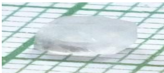
Fig.2- Grown single crystal of Cadmium Malonate.