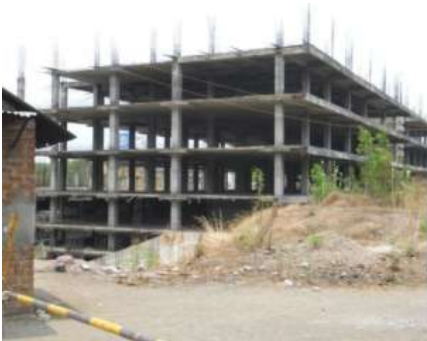
Fig.2 Flat slab with Drop panel