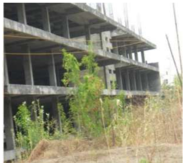
Fig.1- Flat slab with Drop panel

This building is N Kumar building located as Khambla road Nagpur, flat slab with drop panel for comparison of this system with conventional beam column framed system.