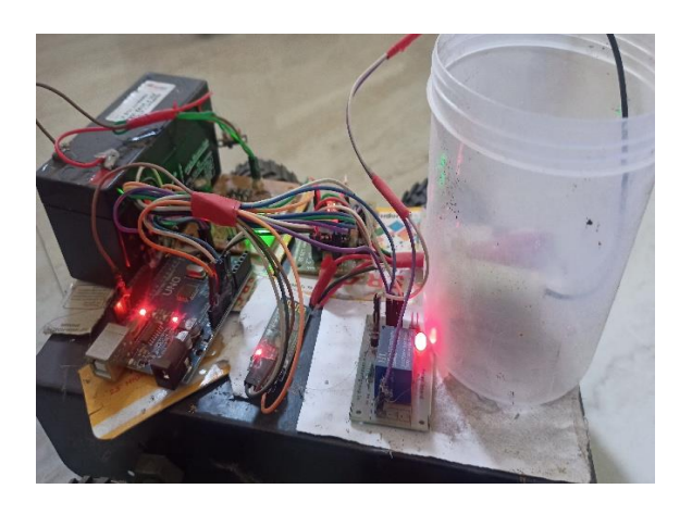
Fig.3: Iot Enable Pesticide Sprayer Robot

Before spraying the pesticides with this robot, the farmer must follow the steps: 1) Fill the required pesticides into tank 2) Start spraying rover 3) Login with android application 4) Connect app with Bluetooth 5) Send commands using application 6) Move rover on field 7) Change direction of sprayer 8) Switch sprayer/pump on/off 9) Charge the battery The robot is installed in the farm and is operated by an Android application and is powered by IoT. DC motors are used for the robot's motion that are governed electronically by Arduino UNO with the assistance of L293D. The HC-05 Bluetooth module receives signals from the input and sends them to the controller, which in turn spins the engine. By obtaining the signal, DC motors are switched ON and OFF by allowing Arduino to have a specific pin. An adequate velocity is provided by 300rpm DC motors. Bluetooth module connects to the digital key of Arduino UNO, which receives the signal installed on the operator's Smartphone from the Android app. Pesticide spraying, which can be done with the assistance of a pesticide sprinkling pump, can be done on a regular basis if the relay switch is turned on. The agricultural robot is used to control functions such as pesticide spraying, and it is controlled using a Bluetooth module that communicates between an Android application and the robot for a low cost.