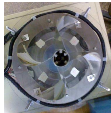
Fig. 2- Rotors Connected to Stator

The main factor for our design is due to its attachment to the stator of our generator and to some extent the magnetic levitation. From Fig.2, it is observed that our streamlined design eliminates the scoop on the upper half of the Savonius model and winds down from the top of the shaft to the circumference of the circular base thus providing a scooping characteristic towards the bottom. This therefore concentrates the mass momentum of the wind to the bottom of the sails and allows for smoother torque during rotation. A standard Savonius model for this design would have created a lot of instability around the shaft and on the base which could eventually lead to top heaviness and causing the turbine to tip over.