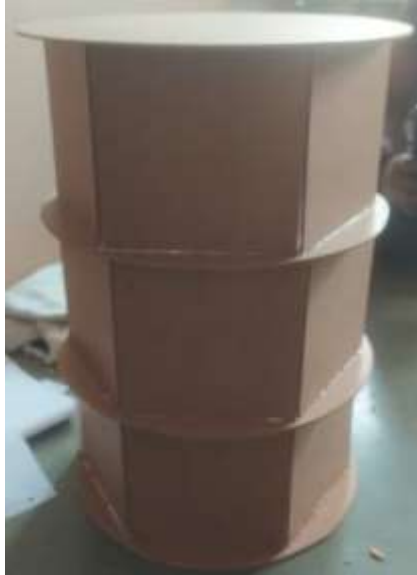
Fig. 1- Rear view of prototype

All readings are taken according to this design. The test is performed on the prototype.