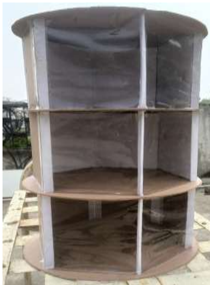
Fig. 2- Front view of prototype

Readings of experiment – As Taguchi design suggested we taken readings as follow.