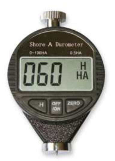
Fig. 5- Durometer to measure hardness[20]

https://doi.org/10.46335/IJIES.2023.8.5.7 e-ISSN Vol. 8 , No. 5, 2023, PP. 32-37 International Journal of Innovations in Engineering and Science, www.ijies.net