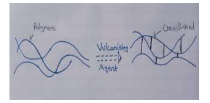
Fig.3- Vulcanisation of rubber

Application- Natural rubber is soft, sticky and has less tensile strength. It is vulcanised to make it more strong, tough and elastic.