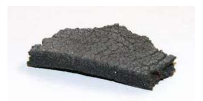
Fig. 2- Abrasion in rubber product[18]

Different rubber polymers will have greater or less resistance to ozone. A common effect includes cracking along the exposed, stretched, or stressed face — this is sometimes referred as dry rotting.