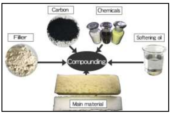
Fig. 4- Compounding of Rubber Products[19]