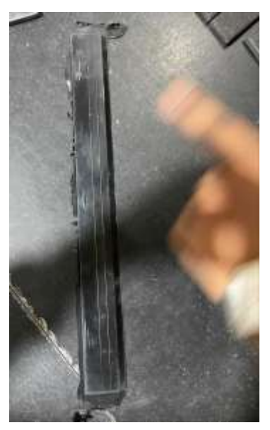
Fig. 6-Product Developed IV. RESULT

The purpose of the research is to develop a product ,which can resolve the issues and defects occurring in the elastomer products being manufactured.