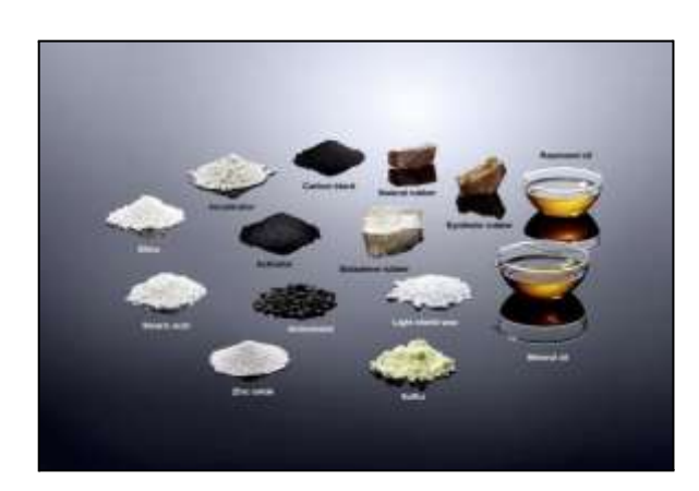
Figure No 2.Additives

Uses- Mainly used to prevent thermal and oxygen ageing and could effectively prevent copper damage used in light coloured and transparent rubber products and in foam latex products.