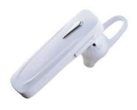
Fig. 7- Bluetooth Connectivity: