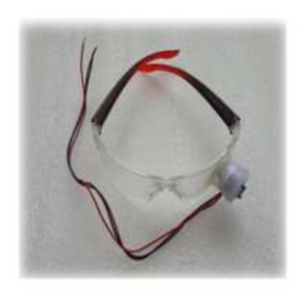
Fig..6-.Eye Blink Sensor

Eye Blink Sensor Is Used For Eye Blinking Measure Time