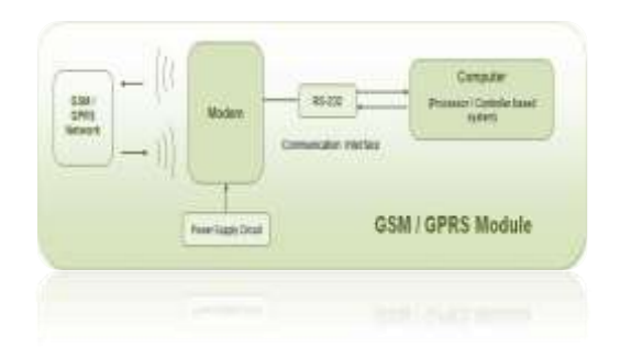
Fig. 2.Gsm And Gprs Module.

2. Adc: A/D Converter Is That It Can Continuously Follow The Input Signal And Give Updated Digital Output Data If The Signal Does Not Change Too Rapidly. In Addition, For Small Input Changes, The Conversion Can Be Quite Fast.