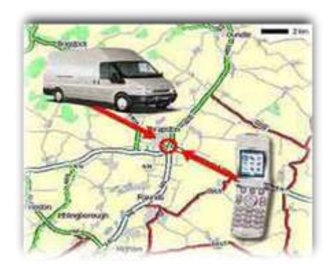
Fig 4.Gps Tracking Location.

The Gps Concept Is Based On Time And The Known Position Of Specialized Satellites. The Satellites Carry Very Stable Atomic Clocks That Are Synchronized With One Another And To Ground Clocks. Any Drift From True Time Maintained On The Ground Is Corrected Daily. Likewise, The Satellite Locations Are Known With Great Precision.