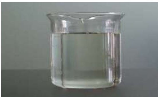
Fig :- Polyethylene Glycol

Polyethylene glycol (PEG) is a polymer deduce from ethylene oxide is a beneficial component for acquiring solid dispersions due to their physicochemical properties. They are also responsible for biocompatibility; odorless characteristics; neutrality; nonirritating; and solubility in many organic solvents and in water, providing a quick release of the dispersed drug, and facilitating the process of obtaining by the solvent method PEG has a low melting point, quick solidification rate, capacity to form solid solutions, low cost and low toxicity and is therefore mostly used as vehicle for the anticipation of dispersions.