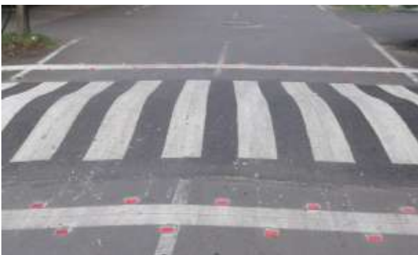
Fig: Speed hump

The speed humps are circular, raised areas placed over the roads. They are normally 10 to 14 feet in length in the direction of travel and is 7 to 10 cm high thus making them dissimilar from the speed bumps. The profile of a speed hump can be rounded, parabolic or sinusoidal. They are tapered as they reach the kerb on each end to permit proper drainage. Speed humps are fit where low speeds are desired. Speed humps create a rough ride for drivers as well as passengers and can cause severe pain for people. They enforce large vehicles, such as emergency vehicles and those with rigid suspensions, to travel at slower speeds, they may increase noise and air pollution and have questionable aesthetics.