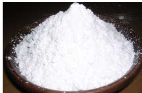
Fig :- Corn Starch