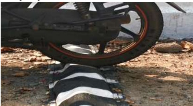
Fig : Deformation of breaker

The Non Newtonian fluid speed breaker can be either permanently or temporarily placed at a desired location, such as in street or roadway. The material in the reinforced rubber layer tubes can be selected based on a desired shear rate. The shear rate selected will correspond to predetermined vehicle speed. The non-Newtonian fluid acts as controlling the resistance by the strip to its deformation. It depends on the speed of the wheels of the vehicle on it. Thus, if the vehicle travels at a low speed (within speed limit) the fluid has a low viscosity and the strip is easily deformed, whereas if the speed of the vehicle is high (Beyond the speed limit) the viscosity of the fluid is high and as a result has great resistance to deformation, thus forming a rigid obstacle to the passage of the vehicle.