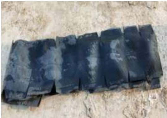
Fig:- Rubber Matting

Recycled rubber used in this breaker. The thickness of rubber matting is 3 mm.