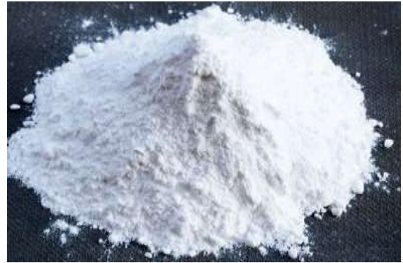
Fig :- Silica Nano Powder