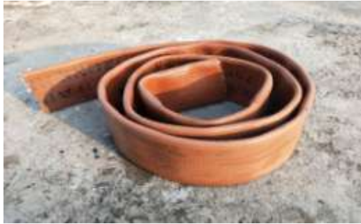
Fig:- RRL Pipe