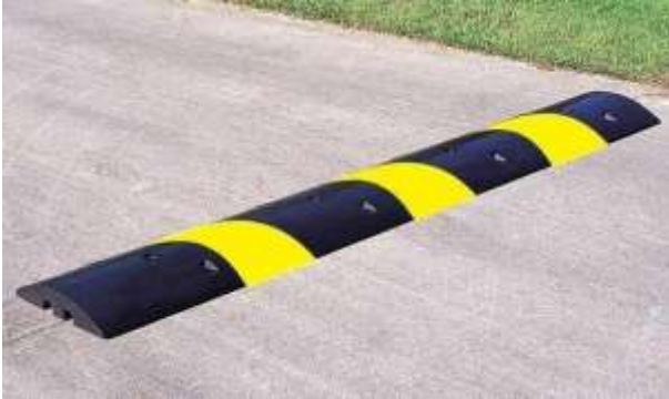
Fig: Speed bump

vehicle, increases response time of emergency services, it requires additional road markings and traffic signs and it increase in traffic noise and pollution.