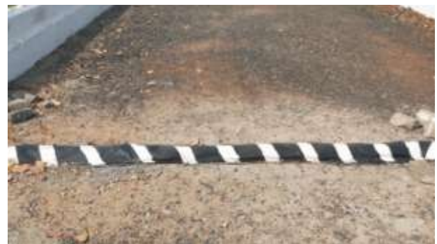
Fig: Non – Newtonian fluid speed breaker

The non-Newtonian fluid acts as controlling the resistance by the strip to its deformation. It depends on the speed of the wheels of the vehicle on it. Thus, if the vehicle travels at a low speed (within speed limit) the fluid has a low viscosity and the strip is easily deformed, whereas if the speed of the vehicle is high (Beyond the speed limit) the viscosity of the fluid is high and as a result has great resistance to deformation, thus forming a rigid obstacle to the passage of the vehicle. Thus the speed of the vehicle is controlled due to the combined effect of non-Newtonian fluids.