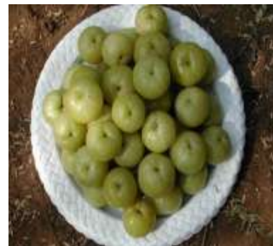
Fig. 7: Fresh Aonla fruit

Large fruit is almost the same. The economics of the developed machine was estimated by considering the cost of the raw materials, overhead charges and labor charges. The cost of operation was calculated by estimating the fixed cost and variable cost.