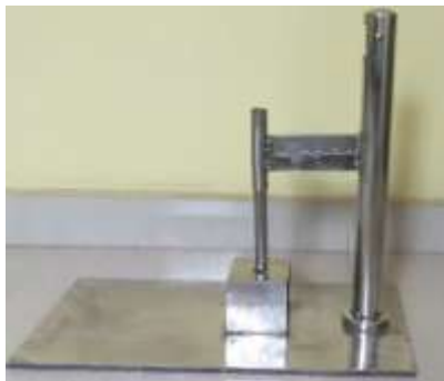
Fig. 6: Frame

The frame consists of base plate and vertical pipe, to which a handle, plunger and fruit seater. The vertical pipe is welded to the base plate. The frame consists of Base plate: 450×250 mm Height of frame: 450 mm.