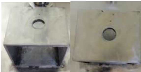
Fig. 3: Aonla platform and seat

Maximum diameter of aonla seed: 18 mm Diameter of the hole provided: 19 mm For self-alignment of the fruit over the platform, a semicircular depression called the fruit seat is provided around the hole. The platform is provided at certain height above the base plate so for collection of fruit core with seed. Height of the fruit core: 40 mm Clearance above and below the core: 30 mm Height of the platform above base plate: 70 mm