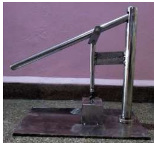
Fig. 8: Aonla seed removal machine