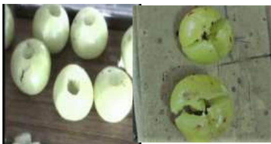
Fig. 9: Aonla fruit after seed removal and shred.