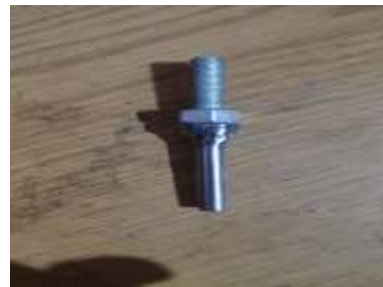
Fig. 4: Plunger

Fruit punching plunger is a solid rod made of stainless steel hinged with the handle, which penetrates the fruit through a guider and removes the fruit core with seed when the handle is moved down. The diameter was selected as 9 mm. The length was designed based on the length of stroke and link arrangements as Stroke length of plunger: 67 mm Length of the guider: 113 mm Extension below guide: 10 mm Distance between plunger hinge point and guide: 70 mm Total length of plunger = 67+113+10+70 = 260 mm.