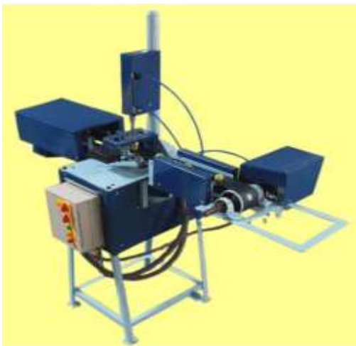
Fig.1: Continuous seed removing machine

2.E. Nambi (2012) CIGR- Developed a pneumatic assisted electronically controlled continuous aonla seed removing machine. The machine was evaluated with three different plunger’s viz., sharp edge, hollow cutting edge and star edge in different orientation of fruit with three varieties of aonla (Kanchan, Chakaiya and NA-7).