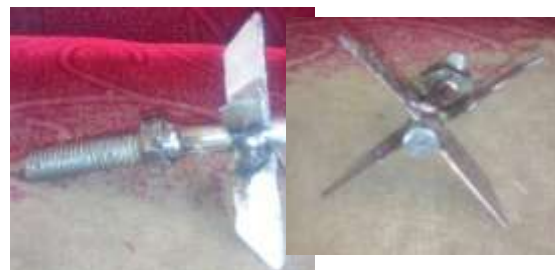
Fig. 5: Cutting blade

Cutting blade made stainless steel and its connected to the punching plunger solid rod, the push down the blade plunger move down and blade cut aonla in shredded. The length depend upon the aonla diameter, the maximum diameter of aonla 50 mm with allowances 60 mm length of cutting blades, thickness 2 mm, width 12 mm.