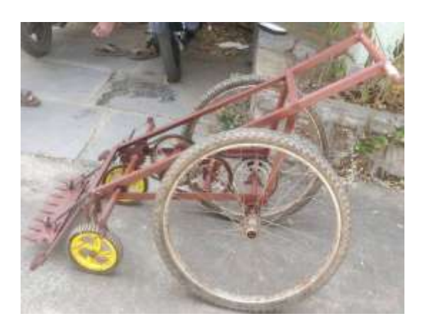
(a) Side view

As per the designed and analytical calculations made following model is developed.