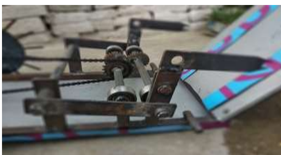
Fig.4- Transplantation of Paddy Seedling

Practically, when rice planting machine was brought into action and pushed up to 3000mm, the total number of seedlings transplanted were 20. The time taken for this was 17 seconds. Total number of paddy seedlings transplanted in one hour is 4200. In one hectare area (Square Farm), approx. 330 columns and approx. 330 rows of paddy seedlings can be transplanted. So, total number of paddy seedlings transplanted in one hectare is approx. 1,10,000. The total time required in transplanting is 26.4 to 27 hours.