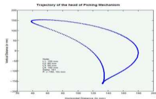
Fig.3- Optimized length and angle of the Mechanism