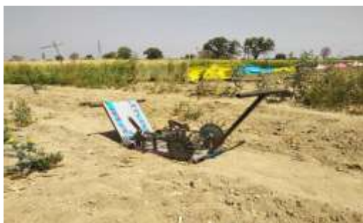
Fig. 2- Rice Plantation Machine

In the present experimental set up when the machine is pushed from paddy support plate in the field for operating it, the base wheels rotate in anticlockwise direction. This produces power which is transmitted towards mechanical arms with the help of chain drive. Here, gear pair plays a vital role as it changes the rotational direction from anticlockwise to clockwise direction. The mechanical arms start oscillating on its axis. While oscillating it grabs the paddy seedlings from paddy support plate and plants it in the field. So, finally rice planting of rice seedlings can be performed