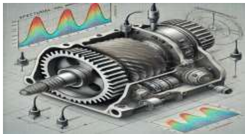
Fig 2: Vibrational Analysis of worm gear box

operation and analyzing these signals to identify abnormal patterns indicative of faults.