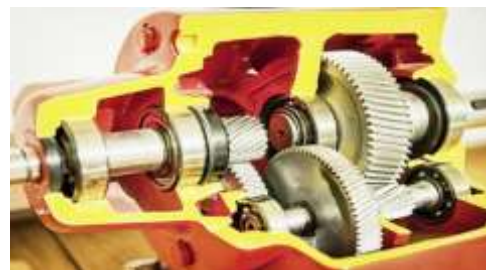
Fig 1: A cross section of gearbox

shafts. Due to the harsh operating surroundings and mechanical complications, gearboxes are prone to faults, which can lead to expensive failures if not linked and addressed beforehand. As a result, vibration analysis has come one of the most extensively used ways for gearbox fault discovery and condition monitoring. This paper presents a review of colorful vibration analysis ways applied to gearbox diagnostics and prophecies , fastening on fault discovery, fault vaticination, and system trustability. The review draws from multitudinous studies conducted over several decades, presenting an overview of the s tate- of- the- art styles and their elaboration.