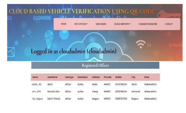
Fig(d) Cloud Admin Page