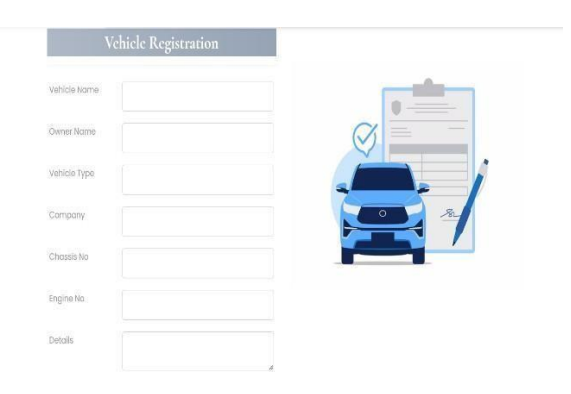
Fig © - Vehicle Registration Page