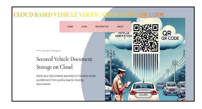
Fig (a) Home Page