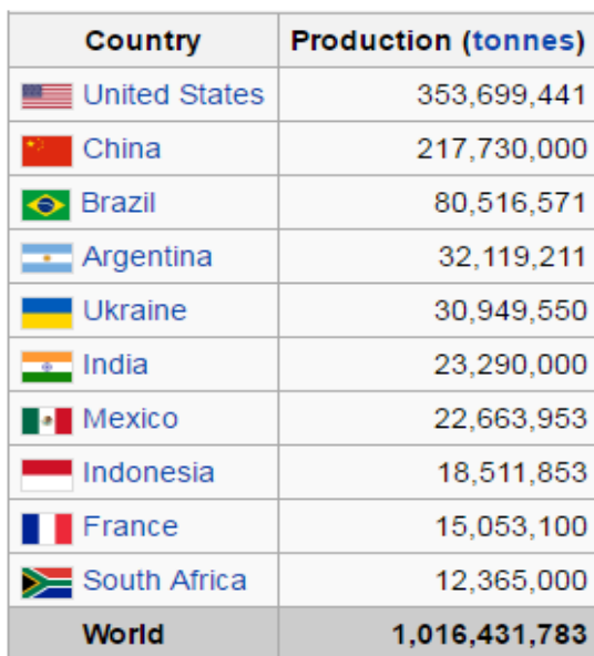
Fig 1. Global Maize Distribution

The maize is cultivated throughout the year in all states of the country for various purposes including grain, fodder, green cobs, sweet corn, baby corn, pop corn in peri-urban areas. The predominant maize growing states that contributes more than 80 % of the total maize production are Andhra Pradesh (20.9 %), Karnataka (16.5 %), Rajasthan (9.9 %), Maharashtra (9.1 %), Bihar (8.9 %), Uttar Pradesh (6.1 %), Madhya Pradesh (5.7 %), Himachal Pradesh (4.4 %). Apart from these states maize is also grown in Jammu and Kashmir and North-Eastern states. Hence, the maize has emerged as important crop in the non-traditional regions. State like Andhra Pradesh which ranks 5th in area (0.79 m ha) has recorded the highest production (4.14 m t) and productivity (5.26 t ha ) in the country although the productivity in some of the districts of Andhra Pradesh is more or equal to the USA. Maize can be grown successfully in variety of soils ranging from loamy sand to clay loam.