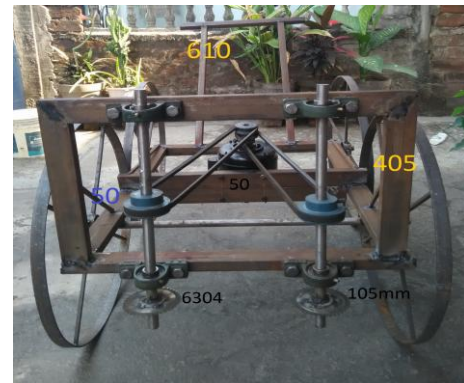
Fig.2.Maize Reaper Machine