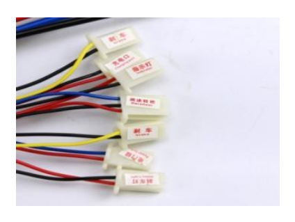
Fig.3 Functions of Pins