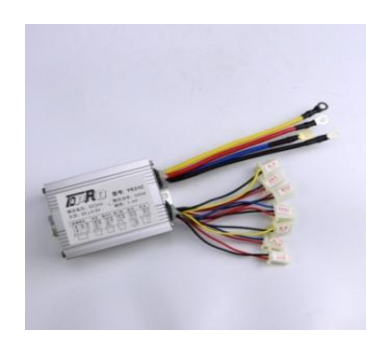
Fig.2 Controller Device

The mechanism of an electric speed controller differs depending on whether you own an adaptive or purpose-build electric bike. An adaptive bike includes an electric drive system installed on an normal bicycle. A purpose-built bike, more expensive than an adaptive bike, provides easier acceleration and affords extra features.