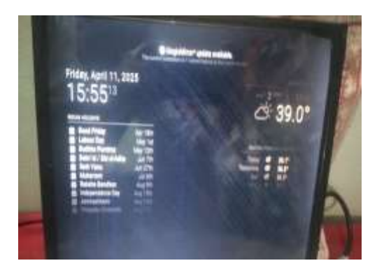
Figure 5 Display Front Interface

Figure 6 shows the back of the Smart Mirror has a compact and organized hardware setup. An LCD screen is securely mounted at the center and connected to a display driver board that links to the Raspberry Pi 4 via HDMI. The Raspberry Pi is on the right side and powered by a 5V/3A adapter. All components are neatly arranged in a wooden frame with foam padding for insulation and protection, allowing for easy maintenance and proper airflow.