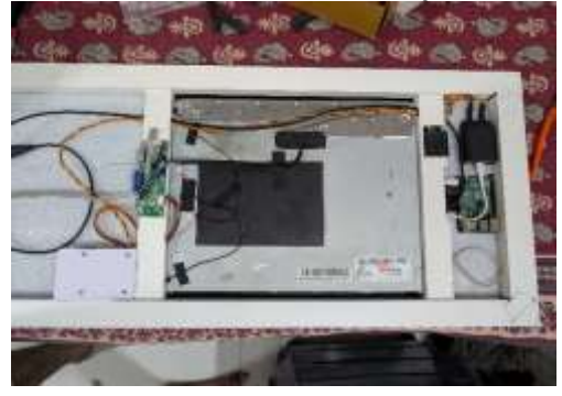
Figure 4 Connectivity of Hardware Components

Figure 6 shows the back of the Smart Mirror has a compact and organized hardware setup. An LCD screen is securely mounted at the center and connected to a display driver board that links to the Raspberry Pi 4 via HDMI. The Raspberry Pi is on the right side and powered by a 5V/3A adapter. All components are neatly arranged in a wooden frame with foam padding for insulation and protection, allowing for easy maintenance and proper airflow.