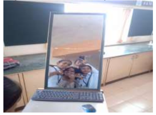
Figure 6 Smart Mirror CONCLUSION

MagicMirror<sup>2</sup>. The screen shows essential modules such as the current date and time, a list of upcoming Indian holidays, and real-time weather updates including temperature, conditions, and forecasts. These elements appear clearly through the two-way mirror, creating the illusion that the information is floating on the mirror surface, while still allowing the user to see their reflection. The layout is minimalist and user-friendly, designed for both aesthetic appeal and functional utility.