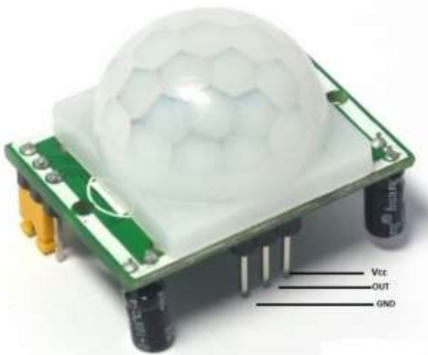
PIR Sensor - (Motion Sensor or Motion Detector)

A passive infrared sensor (PIR sensor) is an electronic sensor which measures infrared (IR) light radiating from objects in the field of view. They are most often used in PIR-based motion detectors. All objects with a temperature above absolute zero emits heat energy in the form of radiation. Usually this radiation is not visible to the human eye because it radiates at wavelengths in infrared region, but it can be detected by electronic devices designed for such a purpose.