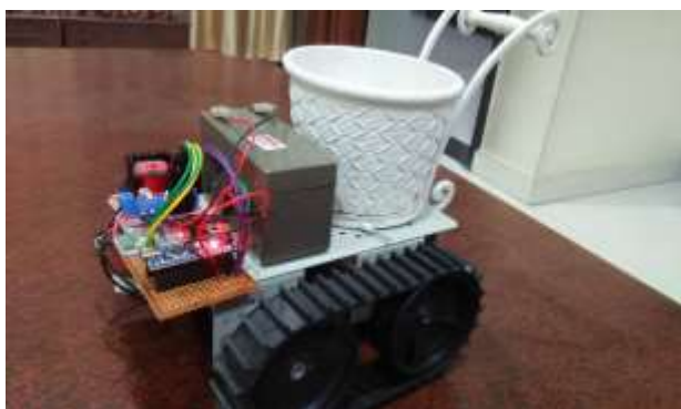
Fig. 2- Prototype of the trolley

The mechanism on the basket will require power to drive the corresponding electronic circuitry. This may be done with the help of DC batteries of requisite power or an arrangement for solar panels and charging units can be done. If solar panels and charging units are used then the baskets maybe charged in off time and made available in the working time.