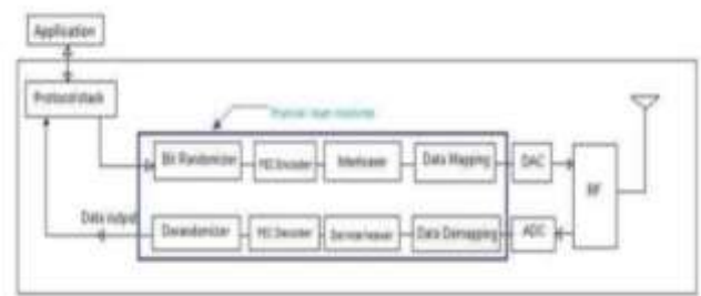
Fig. 1-Internal block of typical IOT device

It runs on a battery that should last a long time. The physical layer needs to be slightly modified to convert the received sensor information into a format suitable for transmission over the cellular network. Both companies are committed to meeting the following key requirements for IOT devices to succeed in the market: