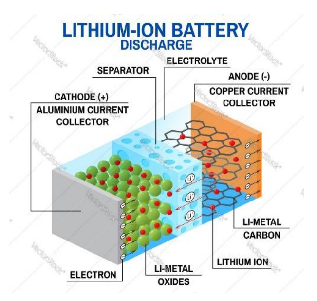
Fig. 2- fig shows the Lithium-ion battery

On discharge, lithium ions are released from the negative electrode, migrate via the electrolyte, and are taken up by the positive electrode. On charge, the process is reversed. Possible positive electrode materials include Li_{1-x}CoO_2 , Li_{1-x}NiO_2 , and Li_{1-x}Mn_2O_4 , which have the advantages of stability in air, high voltage, and reversibility for the lithium intercalation reaction. The Li<sub>x</sub>C/Li<sub>1-x</sub>NiO<sub>2</sub> type, loosely written as C/LiNiO<sub>2</sub> or simply called the nickel-based Li-ion battery, has a nominal voltage of 4 V, a specific energy of 120 Wh/kg, an energy density of 200 Wh/l, and a specific power of 260 W/kg [13] .The cobalt-based type has a higher specific energy and energy density, but at a higher cost and significant increase in the self-discharge rate. The manganese-based type has the lowest cost and its specific energy and energy density lie between those of the cobalt- and nickel-based types. It is anticipated that the development of the Li-ion battery will ultimately move to the manganese-based type because of the low cost, abundance, and environmental friendliness of the manganese-based materials [14]. Although, hydrogen fuel cells have more advantages such as they offer a potentially very clean, energy dense and easy to recharge energy source for vehicles and other systems, but are currently complicated, expensive and hazardous to operate.