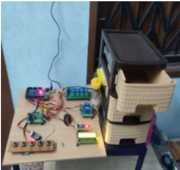
Fig.4. Dispensing of medicine for the morning

The Fig.3 show the display of the time set for opening the tray. The Arduino is interfaced with the DC motor is used to open the tray according to the instruction received.