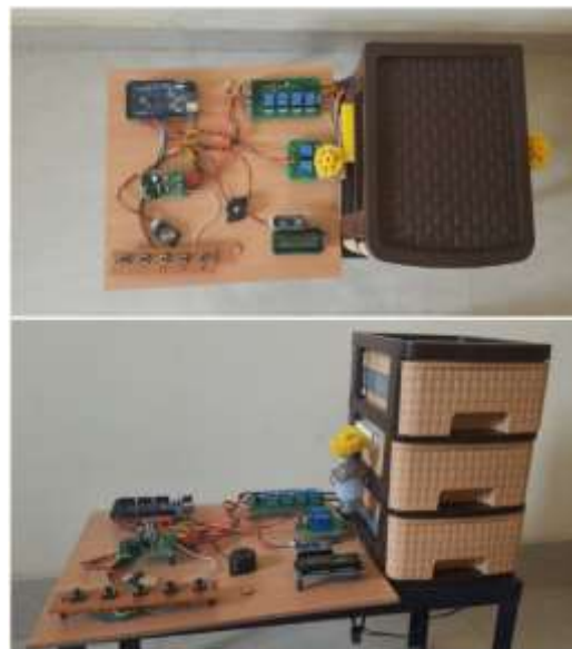
Fig. 2. Hardware implementation of the medicine dispenser

The hardware implementation of the proposed model is shown in Fig. 2 illustrates the integrated system which satisfies the medicinal adherence of the patient. The medicine tray is loaded with the required quantity of medicines. In the three trays, where each tray is used for forenoon, afternoon and night respectively, the medicines are filled.