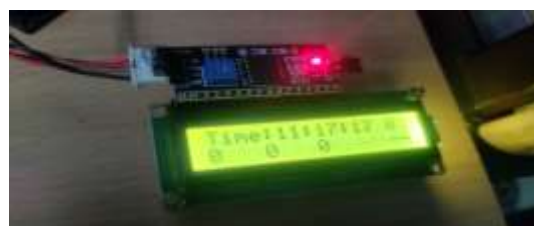
Fig.3. Presetting of the schedule for medicine dispensing

The hardware implemented of proposed system is tested for the desired output and the data is monitored by the care taker from the remote place.