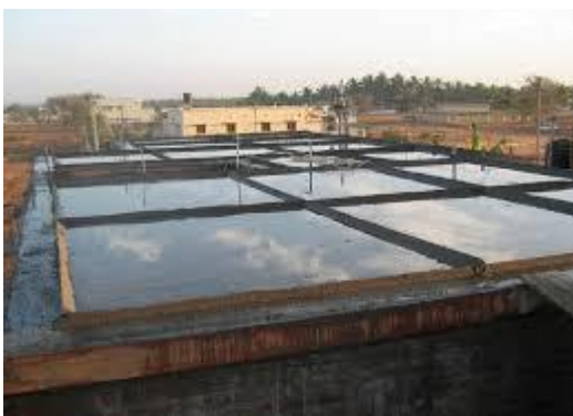
Fig.-2 Cuing by Pounding

(b) Pounding: Pounding On flat surfaces, such as pavements and floors, concrete can be cured by pounding. Earth or sand dikes around the perimeter of the concrete surface can retain a pond of water. Pounding is an ideal method for preventing loss of moisture from the concrete; it is also effective for maintaining uniform temperature in the concrete. The curing water should not be more than about 11°C (20°F) cooler than the concrete to prevent thermal stresses that could result in cracking. Since pounding requires considerable labor and supervision, the method is generally used only for small jobs [20].