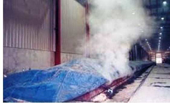
Fig.-5 Steam curing at ordinary pressure

Steam curing at ordinary pressure is applied mostly on prefabricated elements stored in a chamber. The chamber should be big enough to hold a day's production. The door is close and steam is applied. The steam may be applied either continuously or intermittently. An accelerated hydration takes place at this higher temperature and the concrete products attain the 28 days strength of normal concrete in about 3 days. In India, steam curing is often adopted for precast elements, specially prestressed concrete sleepers. Concrete sleepers are being introduced on the entire Indian Railway. For rapid development of strength, they use special type of cement namely IRST 40 and also subject the sleepers to steam curing. Large number of bridges are being built for infrastructural development in India. There are requirements for casting of innumerable precast prestressed girders. These girders are steam cured for faster development of strength which has many other associated advantages.