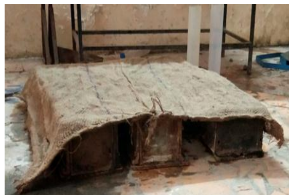
Fig.-4 Curing by Wet Covering

In India wet coverings such as wet gunny bags, jute matting, straw etc., are wrapped to vertical surface for keeping the concrete wet. For horizontal surfaces saw dust earth or sand are used as wet covering to keep the concrete in wet condition for a longer time.