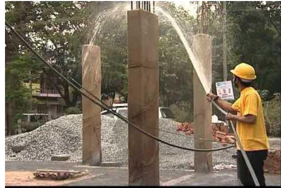
Fig.-3 Cuing by Fogging and Sprinkling

minimize plastic shrinkage cracking until finishing operations are complete. Once the concrete has set sufficiently to prevent water erosion, ordinary lawn sprinklers are effective if good coverage is provided and water runoff is of no concern. Soaker hoses are useful on surfaces that are vertical or nearly so the cost of sprinkling may be a disadvantage. The method requires an ample water supply and careful observation. If sprinkling is done at intervals, the concrete must be prevented from drying between applications of Fogging and sprinkling Burlap must be free of any substance that is harmful to concrete or causes discoloration [21].