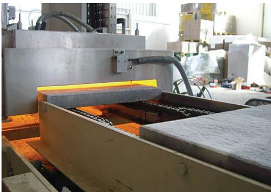
Fig.-7 Curing by Infra-red Radiation

(c) Curing by Infra-red Radiation : Curing of concrete by Infra-red Radiation has been practiced in very cold climatic regions. It is claimed that much more rapid gain of strength can be obtained than with steam curing and that rapid initial temperature does not cause a decrease in the ultimate strength as in the case of steam curing at ordinary pressure. The system is very often adopted for the curing of hollow concrete products. The normal operative temperature is kept at about 90°C [13]. Infrared radiation curing is different phenomenon compared to thermal curing. Infrared radiation is directly incident on the top surface of the composite laminate to be cured and the inner layers are heated by conduction of heat from the top layer. Since the laminate receives heat simultaneously from all the sides of the laminate as it is a volumetric heating process and thereby uniformly heating the entire laminate. Infrared radiation is transparent to the medium of air in between the infrared source and the laminate. It is ideally suited for flat surfaces. The losses are minimized and it is an energy efficient method [25].