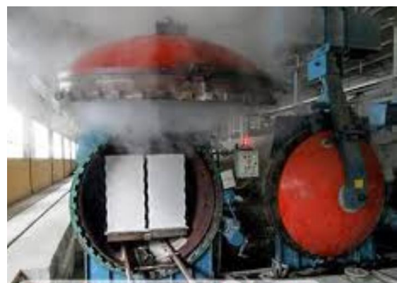
Fig.-6 High Pressure Steam Curing