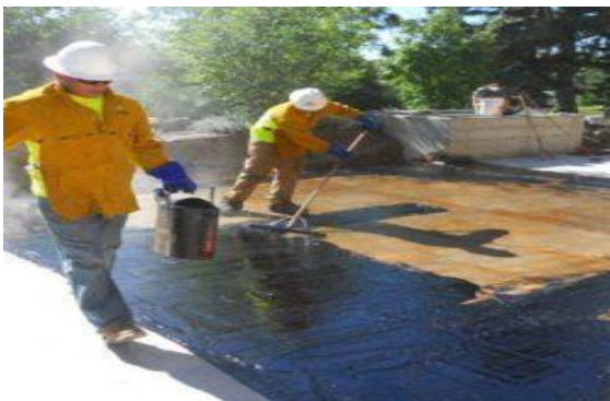
Fig.-8 Curing by Bituminous compound

Bituminous compound being black in colour, absorbs heat when it is applied on the top surface of the concrete. This results in the increase of temperature in the body of concrete which is undesirable. For this purpose, other modified materials which are not black in colour are in use. Such compounds are known as "Clear Compounds". It is also suggested that a lime wash may be given over the black coating to prevent heat absorption.