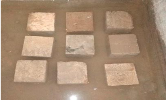
Fig.-1 Immersion curing

method of curing satisfies all the requirements of curing, namely, promotion of hydration, elimination of shrinkage and absorption of heat of hydration. It is pointed out that if the membrane method is adopted, it is enviable that a certain extent of water curing is done before the concrete is covered with membranes. The precast concrete items are normally immersed in curing tanks for certain period. In some cases, wet coverings such as wet gunny bags, hessian cloth, jute matting are wrapped to vertical surface for keeping the concrete wet [9].