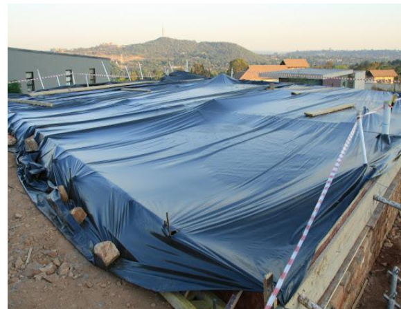
Fig.-9 Membrane curing by using Plastic sheeting

For decorative finishes or where colour uniformity of the surface is required sheeting may need to be supported clear of the surface if hydration staining is of concern. This can be achieved with wooden battens or even scaffolding components, provided that a complete seal can be achieved and maintained. For vertical work, the member should be wrapped with sheeting and taped to limit moisture loss. As with flatwork, where colour of the finished surface is a consideration, the plastic sheeting should be kept clear of the surface to avoid hydration staining.