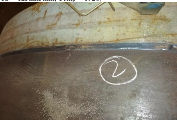
Exp. No 02 (WC=400amp, V= 32volt, SD= 27mm, TS = 150mm/min, Temp = 1860)

Similarly total 9 experiments performed and their temperature and repair result to be measured.