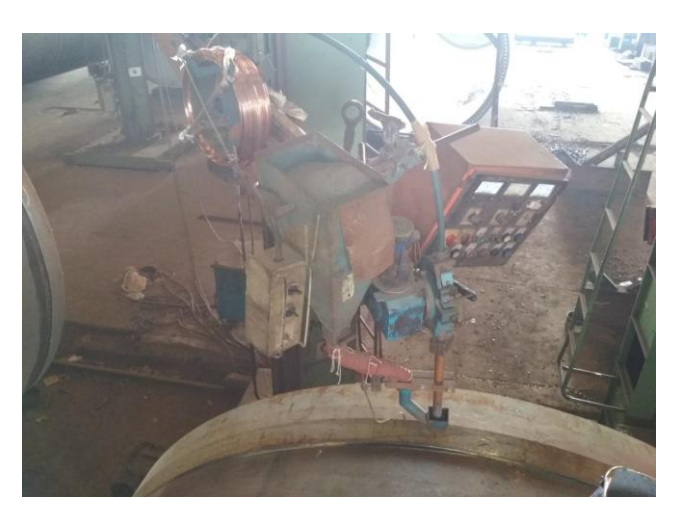
Figure 1: Image during submerged arc welding of tower

Mild Steel (material specification S355/S355 NL+ Z25) is used as a work piece material for the present experiment. The calculated average industry grade mild steel density is 7861.093 kg/m3. Its Young' modulus (a measure of its stiffness) is around 210,000MPA.