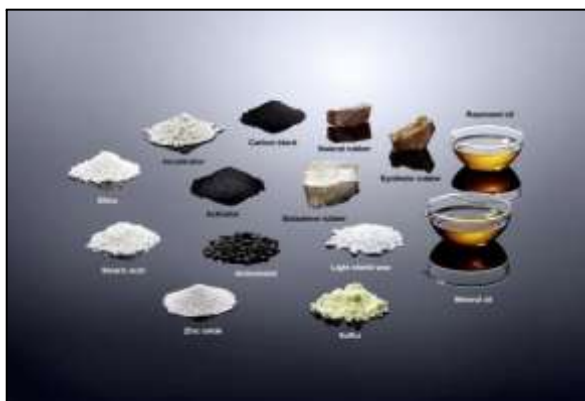
Figure No 2. Additives

Uses- Mainly used to prevent thermal and oxygen ageing and could effectively prevent copper damage used in light coloured and transparent rubber products and in foam latex products.